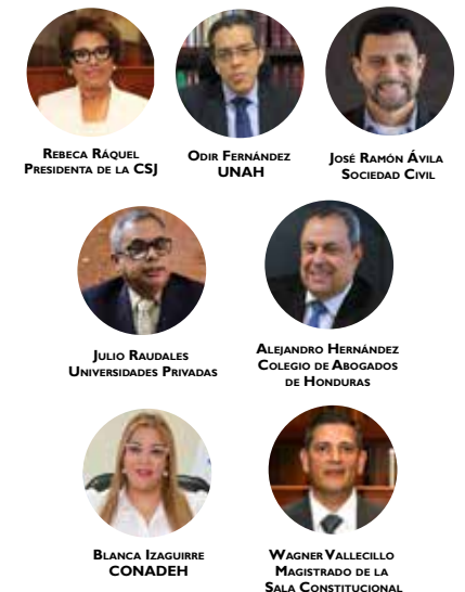
PROPOSED BOARD FOR THE ELECTION OF THE ATTORNEY GENERAL AND DEPUTY ATTORNEY GENERAL OF THE STATE IS FORMED